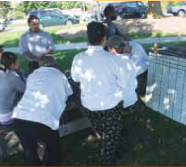
OPEN BOOK MANAGEMENT MEETING

Training, internal promotion, and a push for greater diversity are also integral to Zingerman's strategy to hold turnover costs down while increasing team productivity. While many employers will underinvest in training employees because they expect workers to leave quickly, given the high turnover in the restaurant industry, new employees at Zingerman's will typically receive 70 hours of formal training in the first year