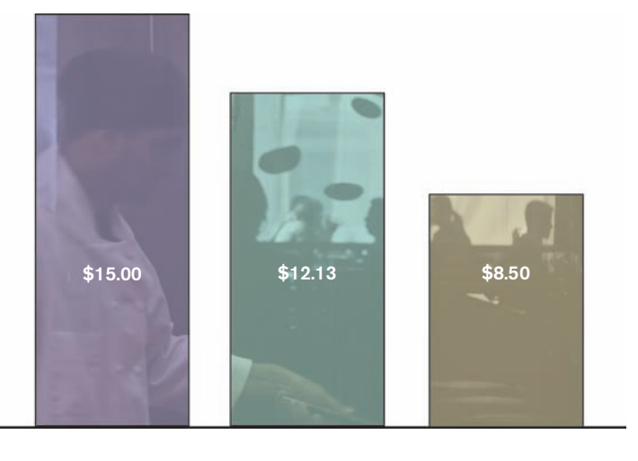
FIGURE 3: Median Earnings by Segment xi